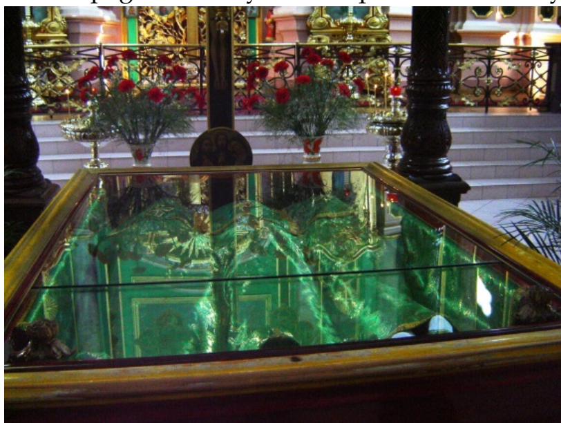
A view of the relics of the martyrs (Ss Anthony, Eustatius & John)