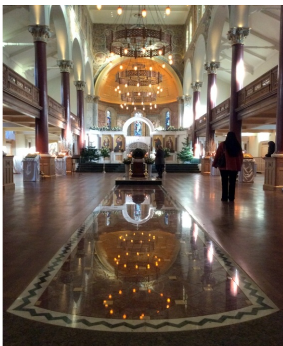
Left: 2004 - before refurbishment