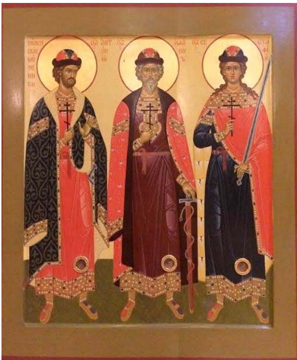
Icon of Ss Anthony, Eustatius & John with their relics in the Cathedral of the Mother of God and All Saints in London